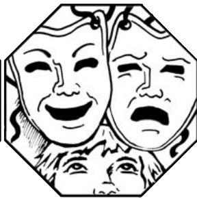
Pursuit of Happiness